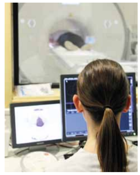
The new 3T scanner was demonstrated to members of the South Cleveland Heart Fund Committee

grateful patients; and then you have the ripple effect of more donations coming in."