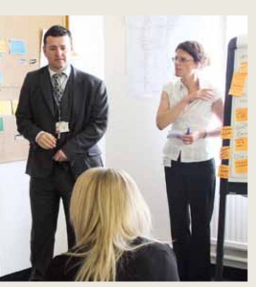
me discussion on improving patient pathways