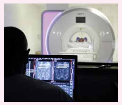
One of the first MRI scans taking place at The Friarage Hospital