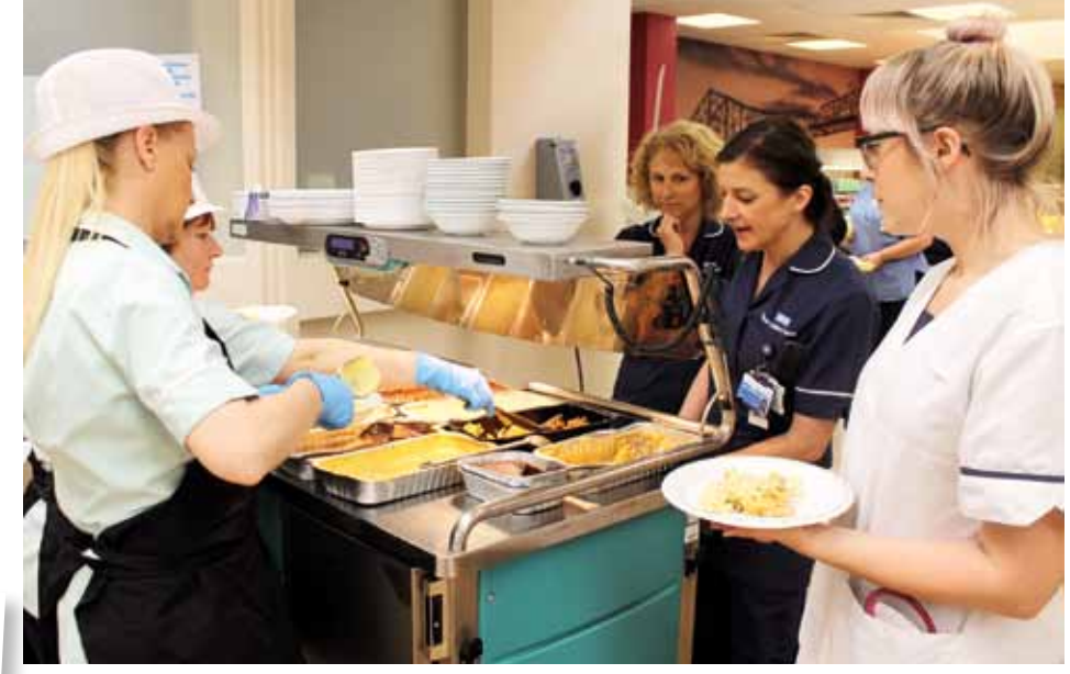
The Come Dine With Us event at James Cook proved popular once again

He was a well-loved and valued member of the Trust and this was evident by the number of people who took the time to attend his funeral and celebrate his life. His family asked for donations to be made to the Great North Air ambulance instead of flowers and £400 was raised.