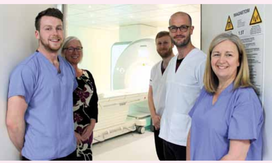
The Radiology Team at The Friarage Hospital welcome the new scanner

Charity's Head of Fundraising, described seeing the MRI scanner being lifted into the hospital as the "realisation of years of hard work and fundraising" by generous members of the public.