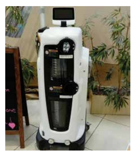
The Neptune system