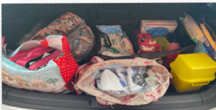
Boot 1 - Before

The pre-trial survey received responses from 7 members of staff and the post-trial survey received 8 responses members of staff. Some staff also provided photos which were taken of their vehicles boots before and when using the kit bags. The surveys used scoring between 1- 10 (where 1 is worst and 10 is best) and were taken by users prior to the use of kit bags and after using kit bags.