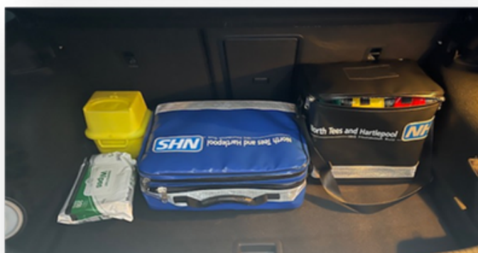
Boot 1 - After

The graph below shows the kit bags gained a higher score in all areas and staff were also asked to comment on the biggest improvement the bags provided, and any difficulties caused by the bags.